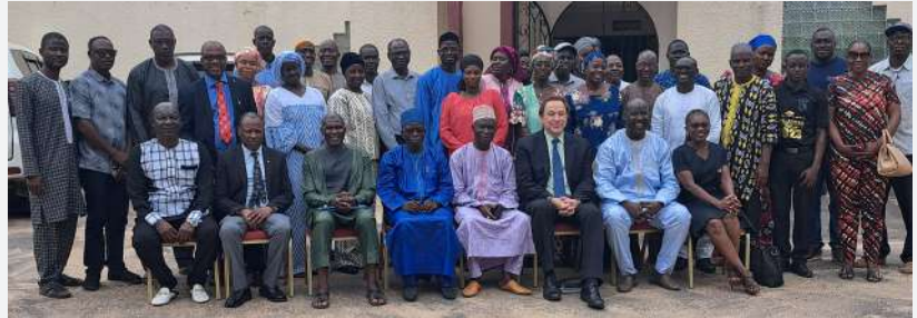
Photo: Some of the participants at The Gambia policy workshop.

Under the Shanghai FIT project, IICBA seeks to 1) build the capacity of countries to develop and operationalize national teacher competences and standards frameworks; 2) improve the competences and skills of teachers in line with the national frameworks; and 3) promote South-South dialogue and cooperation.