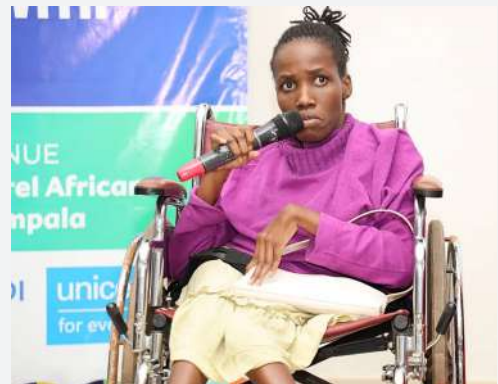
Africa 19 Hub member countries and a delegate at Uganda's national dialogue on inclusive education

Other programs: IICBA contributes to several UNESCO programs such as the CapED and O3 initiatives, supports UNESCO Regional and Country Offices, and manages the Teacher Professional Development Cluster under the African Union's CESA 2016-2025.