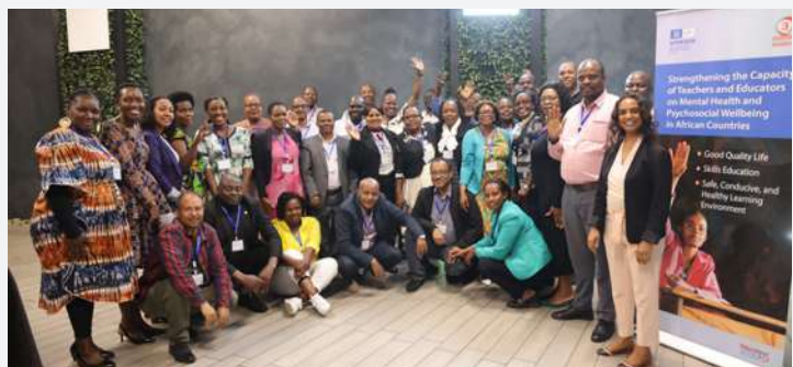
Photo: Participants at an O3 (Our Rights, Our Lives, Our Future) workshop.

Other programs: IICBA contributes to several UNESCO programs such as the CapED and O3 initiatives, supports UNESCO Regional and Country Offices, and manages the Teacher Professional Development Cluster under the African Union's CESA 2016-2025.