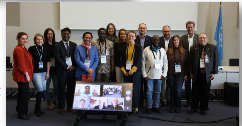
Images (above) BILT Expert Group 2023 Lead & Co-Leads (below) Conceptualization Session BILT Expert Group Building & Construction