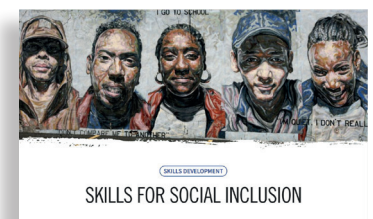
SKILLS FOR SOCIAL INCLUSION

In this course, participants learn how to contribute to the development of inclusive vocational training systems and programmes to overcome a range of existing barriers for disadvantaged groups and individuals.