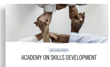
ACADEMY ON SKILLS DEVELOPMENT

The Academy on Skills Development is the flagship programme of ITCILO's capacity building portfolio on Skills and Lifelong Learning. Thanks to the participation of high-level ILO experts in this field, it meets participants at the heart of current debates and dialogue on the future of education and training systems.