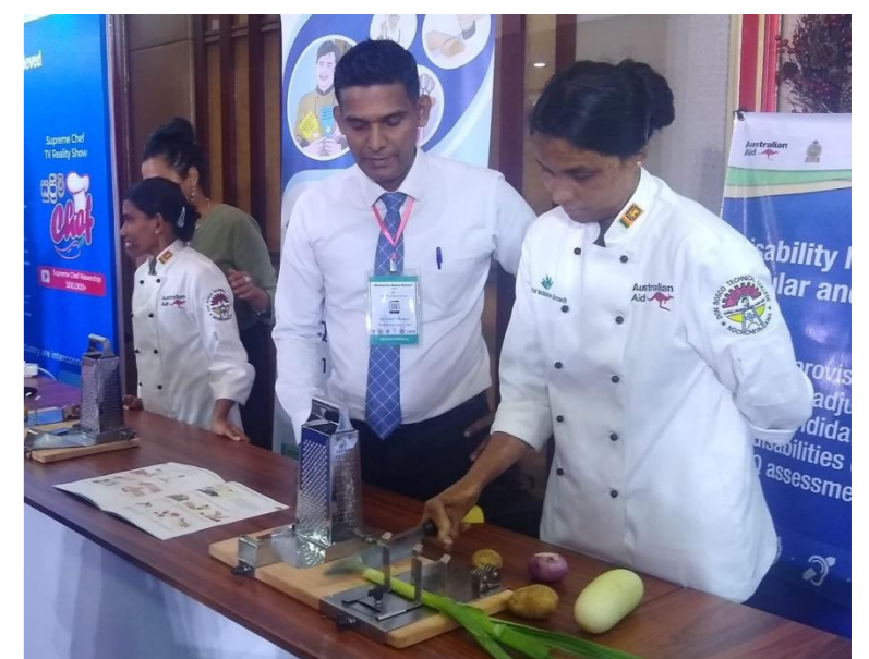
Reasonable Adjustments for Workplaces Demonstration