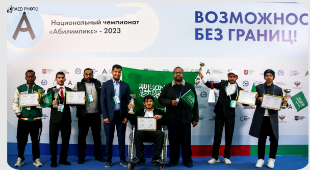
Vocational Excellence Championship for People with Disabilities (Abilympics 2023) Technical and Vocational Training Cooperation (TVTC), Saudi Arabia Moscow, Russia Federation

TVTC's trainees from various training facilities across Saudi Arabia participated in the Vocational Excellence Championship for People with Disabilities, which was held in the city of Moscow (Abilympics 2023), from 20 October to 22 October 2023. The trainees achieved success and distinction in the 'Passing the Skill within the Allotted Time' competition in the specializations of electricity, technical support and network management.