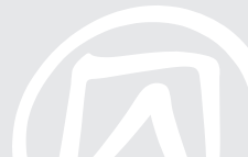
(Mongolia)

Learn more about our facilitators online at: https://ich.unesco.org/en/facilitator