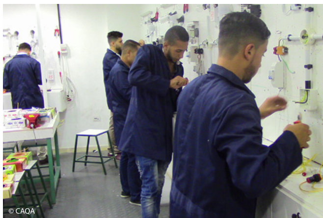
Students learning their trade during the training programme organized by the Centre for Accreditation and Quality Assurance for TVET in Jordan.

and the comparative advantages of technical and vocational education and training over academic education. The workshop was blended with a practical component whereby students were introduced to the TVET Academy, an online platform which was developed to carry curriculum modules and training video materials. Students were encouraged to test the online platform, which not only exposed the students to different ways of learning and training, but also helped them take part in a discussion on the use of such platforms for teaching. The interactive daylong workshop concluded with a discussion on career choices and future possibilities.