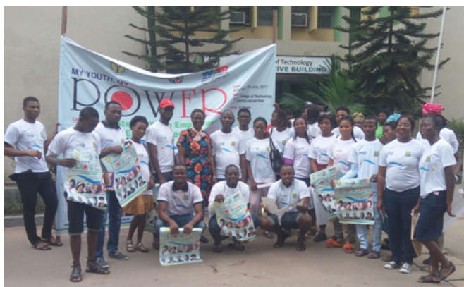
The Yaba College of Technology in Nigeria mobilized young people and the local community with colourful posters and matching shirts.

Despite the benefits of TVET on personal, professional and national development, a recurring issue has been the relative unattractiveness of vocational education and training as compared to academic education for students. Part of this