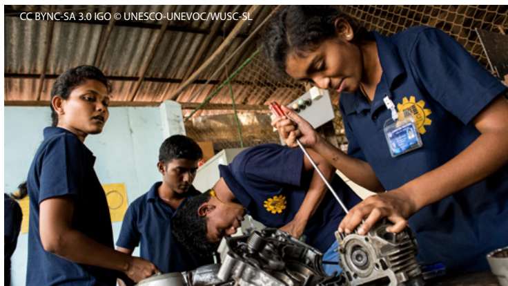
UNESCO-UNEVOC SkillsinAction Photo Competition

Country: Sri Lanka