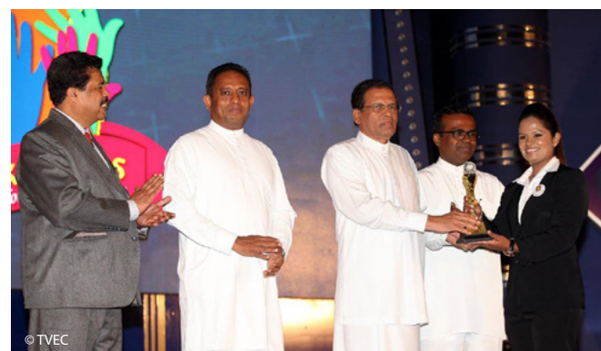
One of the 33 winners of a skills competition organized by the Tertiary and Vocational Education Commission in Sri Lanka receives her prize from a representative of the ministry.

The National Skills Development Agency in India organized, together with the Ministry of Skill Development and Entrepreneurship, an event to celebrate the second anniversary of the SKILLS India initiative. The initiative was launched in 2015 when World Youth Skills Day was first