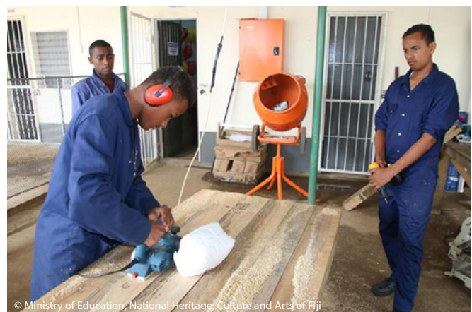
© Ministry of Education, National Heritage, Culture and Arts of Fiji

Fundación Paraguaya in Paraguay held a workshop that targeted about 20 students from the San Francisco de Asís School, a local agricultural school close to the capital, Asunción. The workshop invited students, aged 15 to 19, to reflect on and discuss topics linked to World Youth Skills Day