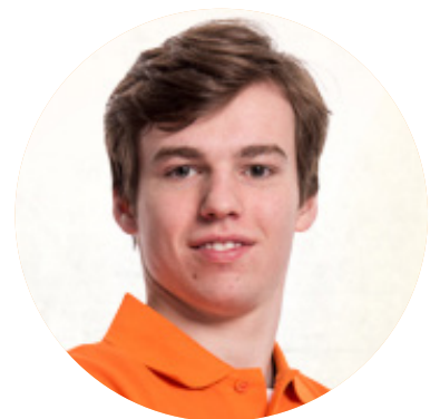
Richard Roolvink, WorldSkills Champion

The workshop helped facilitate an international discourse on re-thinking the image of TVET using multiple lenses. In this framework, researchers from Cedefop presented a study that showed the perception of TVET in European countries. These views were compared and contrasted with views from TVET practitioners from Africa, the Arab States, Asia, and Latin America. The discussion also led to unpacking the role of stakeholders, the influence of cultural traditions, and the need for more investigation in this topic.