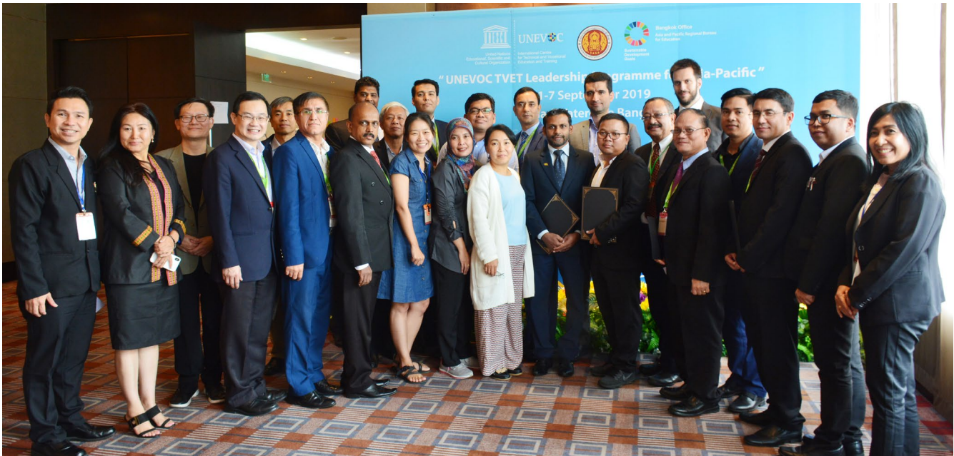
Participants of 2019 UNEVOC TVET leadership programme for Asia and the Pacific