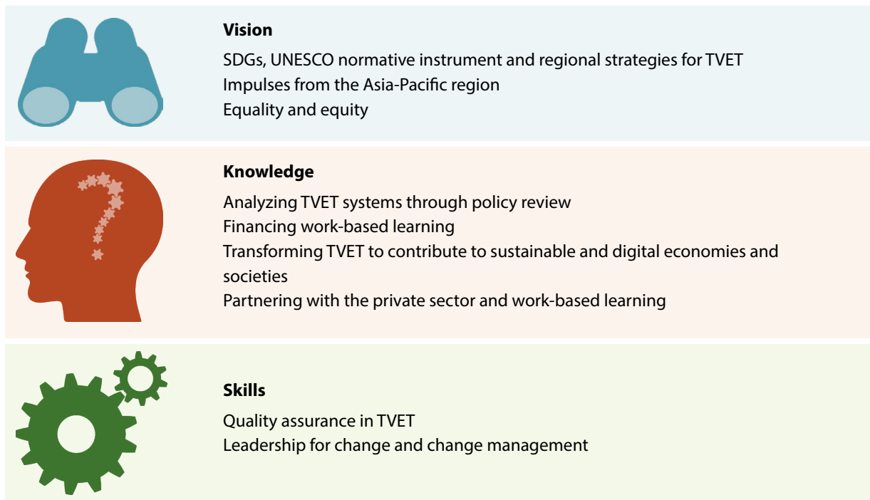
Figure 2. Key challenges addressed in the 2019 TVET Leadership Programme for Asia and the Pacific

The UNEVOC TVET Leadership Programme for Asia and the Pacific addressed key challenges in the region (Figure 2). It was organized jointly by UNESCO-UNEVOC and the UNESCO Bangkok Asia and Pacific Regional Bureau for Education, and hosted by the Office of Vocational Educational Commission (OVEC) and the Rajasitharam College.