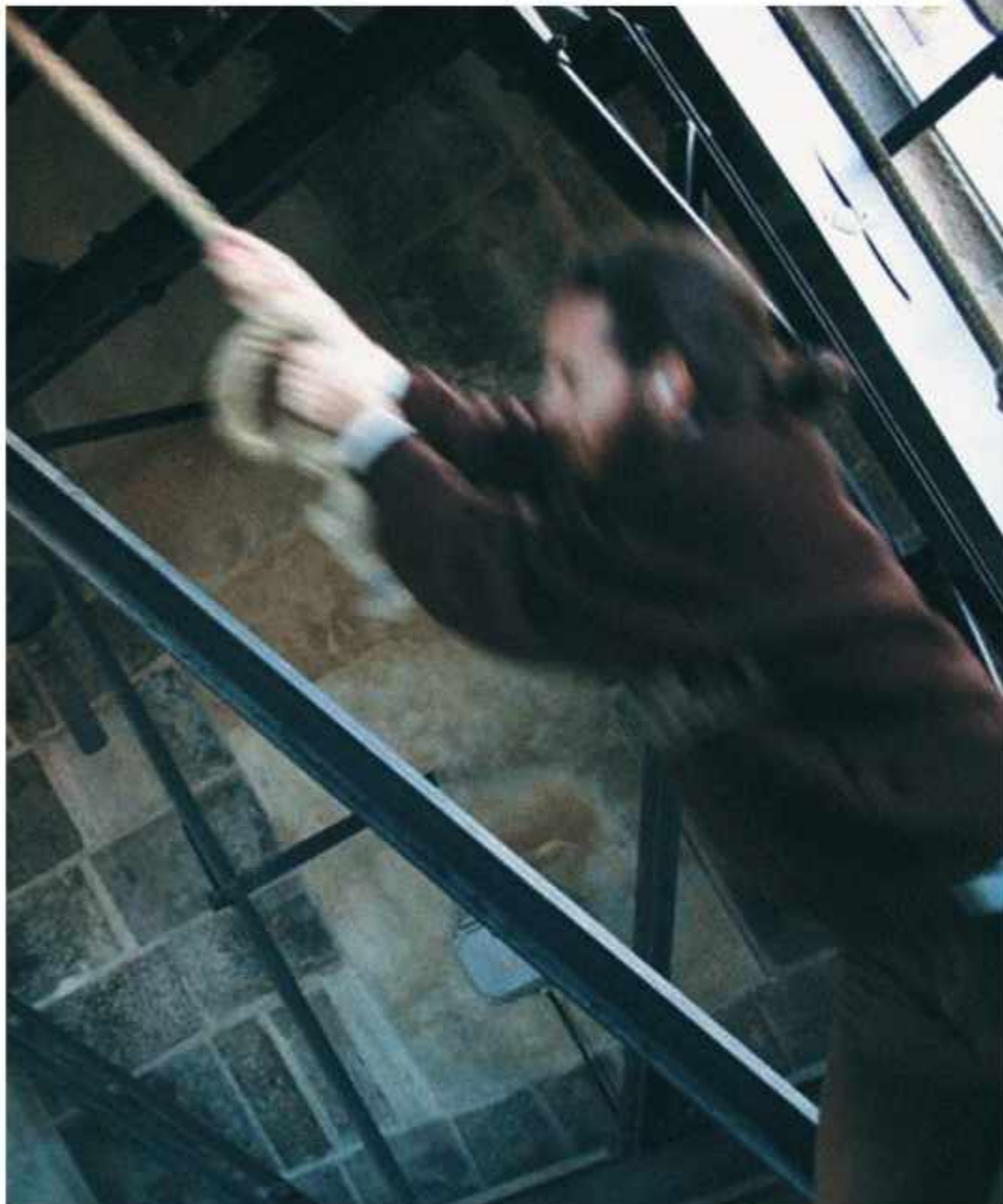
Greek – Catholic Church in Krajná Polana (Svidník district) Electrified bells 2009