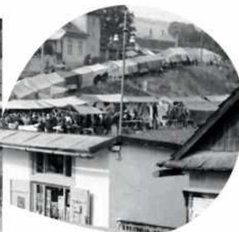
Mall 1944 Unknown author Central – Slovakian Museum Banská Bystrica